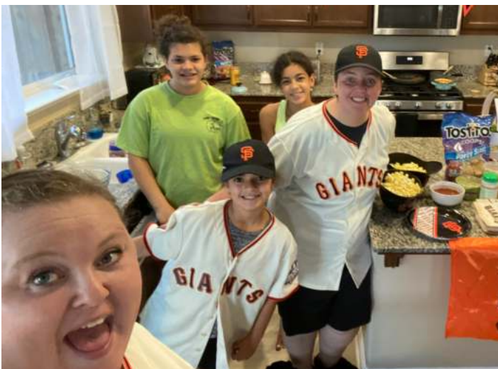
Family of SF Giants fans at home together