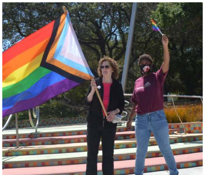
Baby all grown up, June 2021