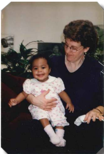
Baby's first trip to the office 1996

At Family Builders when I arrived, we had four board members and five staff. Our offices were in an old Victorian house. We had no computers, no email, no voicemail and no internet. Social workers hand-wrote their 20 page homestudies and handed them to the secretary to type. Phone calls were answered individually by social workers.